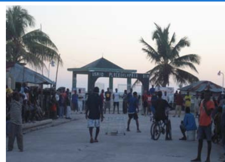
The repaired street and public space has become a welcoming community meeting place