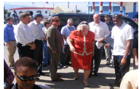
The US Ambassador visiting Cite Soleil

of the country for decades to come. Contractors working in the program are mostly young engineers between 25 and 35 from the very communities in which PREPEP and HSI projects are implemented. Contracts are won by contractors who not only prove their capacity to implement the technical aspects of a project but who also gain the trust of the community involved. The selection of reliable and honest contractors is one of the main keys to PREPEP's success in Cite Soleil and around the country.