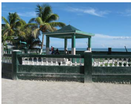
Partial view of Ti Coq public Square

« You, you're from Ti Coq » is a classic insult that people from Les Cayes use whenever they want to criticize someone with a bad up-bringing, someone who is dirty or mean. In reality, Ti Coq is a neighborhood in La Savanne right beside the ocean, a neighborhood that for many people was an unsafe place to go. Today however, Ti Coq is transforming itself and changing its image.