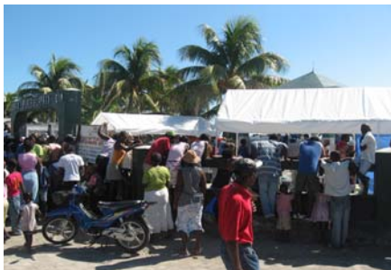
A public event at Ti Coq Place

This solidified the already poor reputation of the neighborhood in the eyes of other residents of Les Cayes. People avoided the neighborhood, afraid for their safety. The community decided that the situation had to change. The government funded several projects for the youth, trying to engage them in productive activities, including a bakery and a brick making factory – but the departure of Aristide meant these projects were put aside.