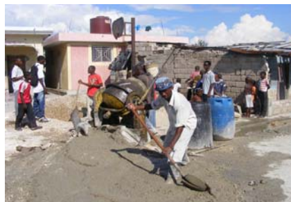
Concrete Paving of Corridor Belekou

The first quarter of 2007 was marked by unrest due to gang violence, kidnapping and murder, and the crackdown operations of MINUSTAH troops against those gangs. This situation hampered PREPEP activities while Cite Soleil alternated between moments of instability and fragile peace. Several gang bases were dismantled, which facilitated the resumption of all project activities. Community participation was instrumental through the life of these projects resulting in vast improvements in the security situation of neighborhoods such as Cite Militaire, Boston, and Simon Pele. Simon Pele is one of the places in which PREPEP work has been the most effective, thanks to community participation and the effort of law enforcement authorities in bringing peace and security to the area.